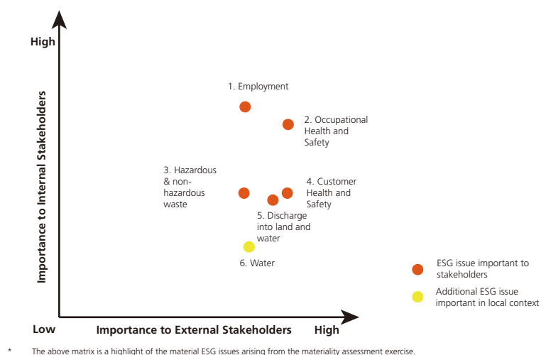
Figure 1 Materiality Matrix

During the Reporting Period, we reviewed the material ESG issues identified in 2017. Our materiality definition takes reference from the ESG Reporting Guide, which is defined as the threshold at which the ESG issues become sufficiently important to investors and other stakeholders that they should be reported. After careful consideration, the board of directors (the “Board”) of the Company agreed that the material issues remain relevant to the business of the Company in the Reporting Period which are presented in a materiality matrix in Figure 1.